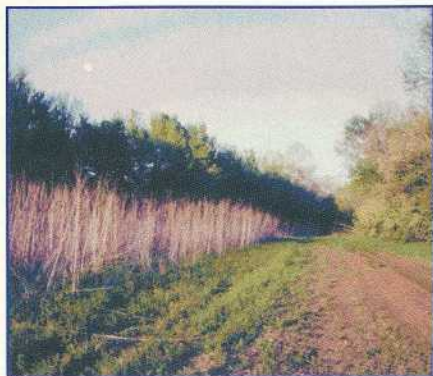
The ball of light

up to my face as I was taking the exposure. That indicates the sun was behind me. So, what's streaking past me in the upper left-hand corner of the photograph? As with the snake, I never noticed the ball of light when I depressed the shutter button.